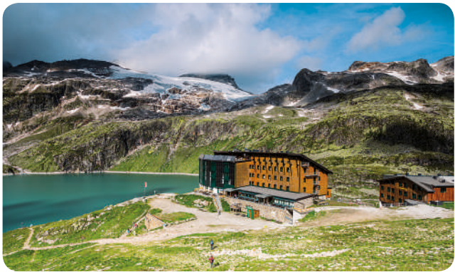
HOTEL RUDOLFSHÜTTE *** MOUNTAIN HOTEL ON 2.315M Austria · Uttendorf/Weißsee glacier landscape www.rudolfshuette.at