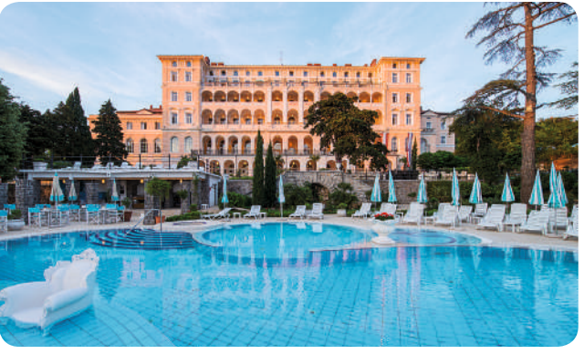
HOTEL KVARNER PALACE **** THE EXCLUSIVE HOLIDAY WORLD AT THE ADRIATIC COAST Croatia · Crikvenica www.kvarnerpalace.info