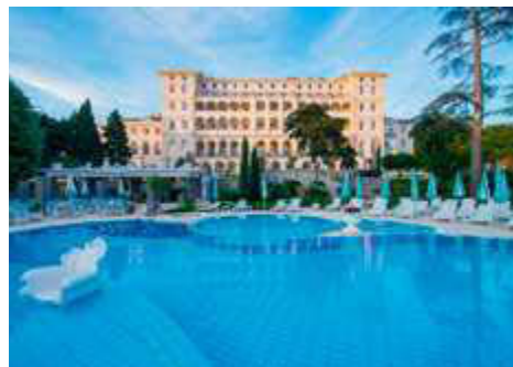
KVARNER PALACE *** Exclusive holiday world on the Adriatic coast Crikvenica / Kvarner Riviera / Croatia www.kvarnerpalace.info