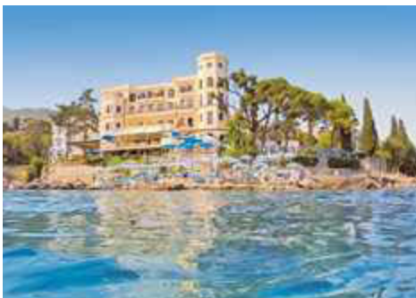
HOTEL MIRAMAR ***** The Adria-Relax-Resort in Opatija / Abbazia Opatija / Kvarner Riviera / Croatia www.hotel-miramar.info