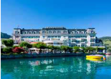
GRAND HOTEL ZELL AM SEE ***** The great lakeside holiday world Salzburger Land / Austria www.grandhotel-zellamsee.at