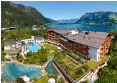
SALZBURGERHOF ***** 5* superior wellness, golf & gourmet hotel in Zell am See Salzburger Land / Austria www.salzburgerhof.at