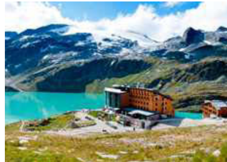
BERGHOTEL RUDOLFSHÜTTE *** at the Weißsee glacier world Ski & mountain experience for families Uttendorf / Salzburger Land / Austria www.rudolfshuette.at