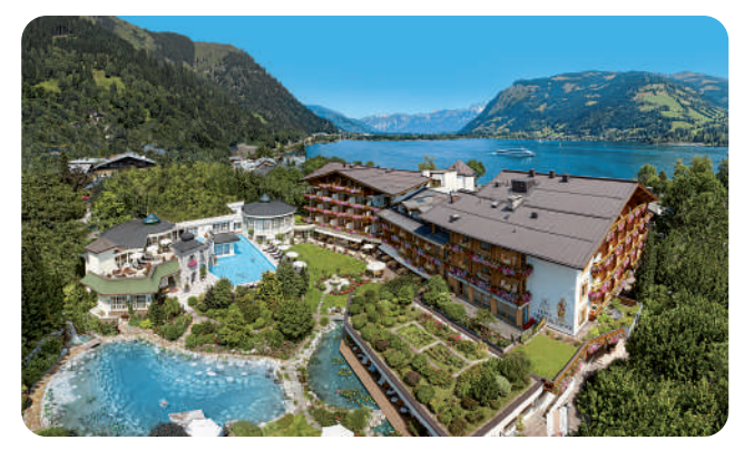
HOTEL SALZBURGERHOF ****** SPA-, GOLF- & GOUREMT-HOTEL Austria · Zell am See · www.salzburgerhof.at