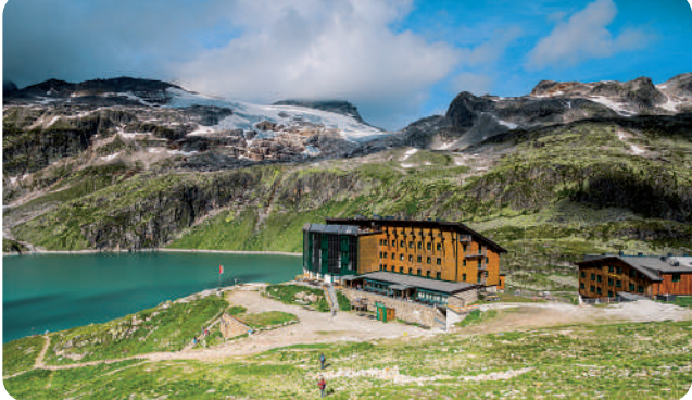
HOTEL RUDOLFSHÜTTE *** MOUNTAIN HOTEL ON 2.315M

Austria · Uttendorf/Weißsee glacier landscape www.rudolfshuette.at