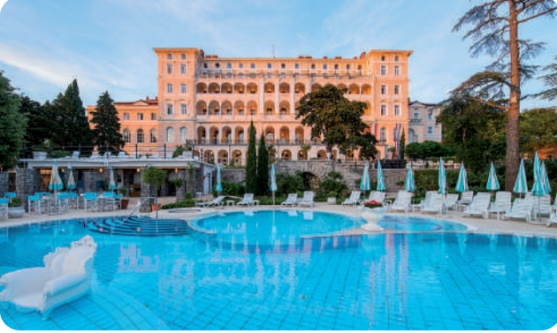
HOTEL KVARNER PALACE **** THE EXCLUSIVE HOLIDAY WORLD AT THE ADRIATIC COAST

Croatia · Crikvenica www.kvarnerpalace.info